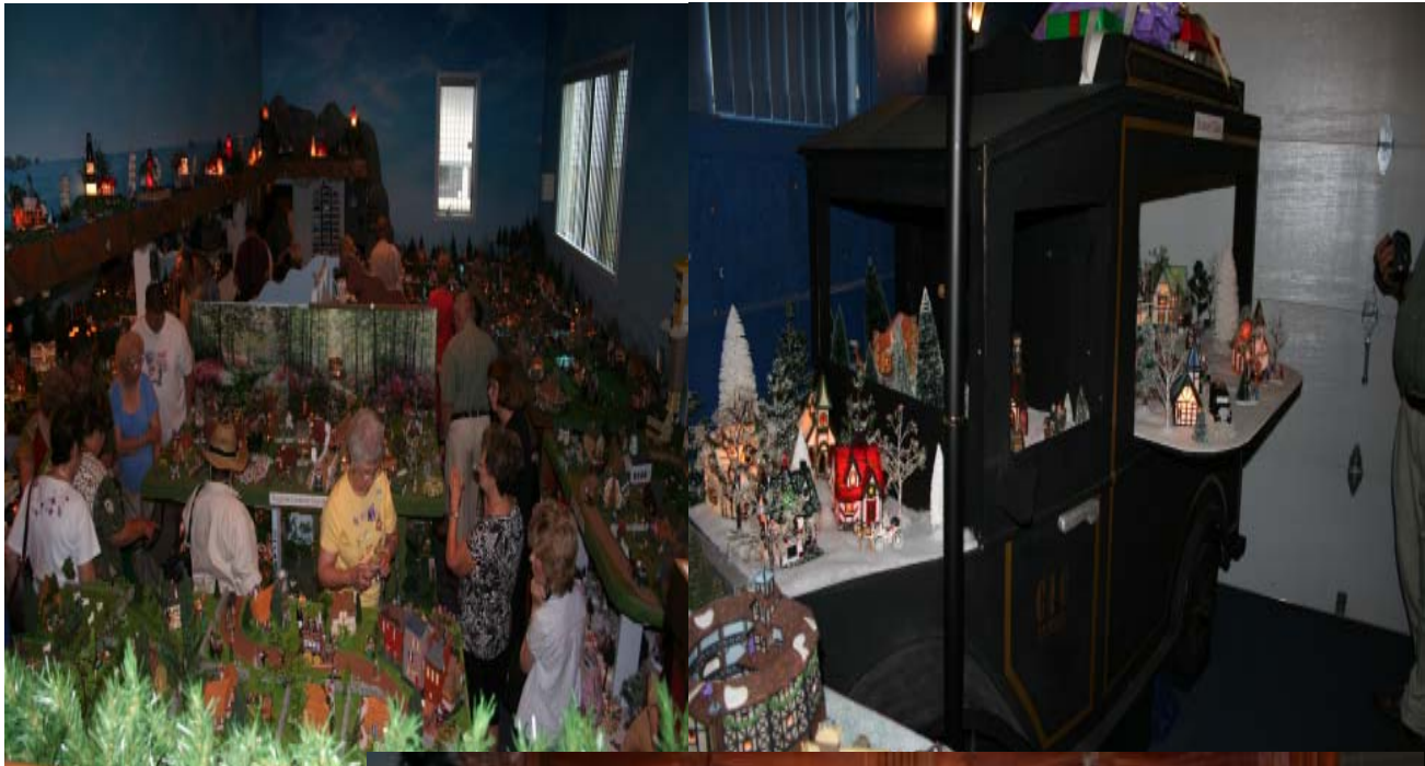
The next few pages contain pictures from 2008 NCC National D56 Convention. The two pictures above are from Tiny Town.