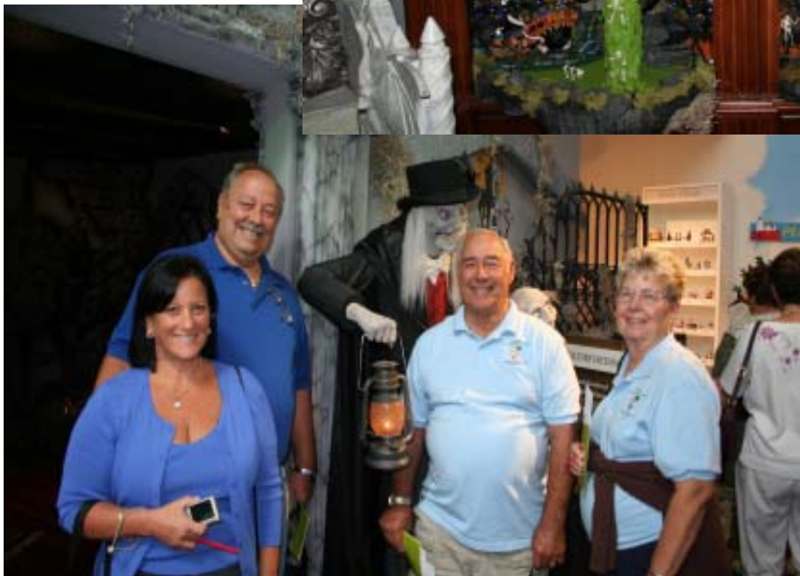
The bottom two pictures were taken at the Department 56 Headquarters in their new Halloween display area. Notice how the display actually hangs over the outside edge of the shelf and the skeleton waterfall extends two shelves.