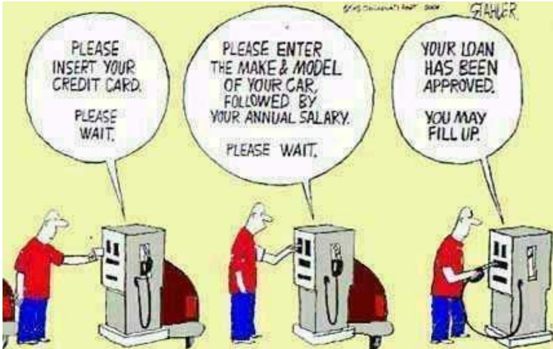
Name a mobile National Monument