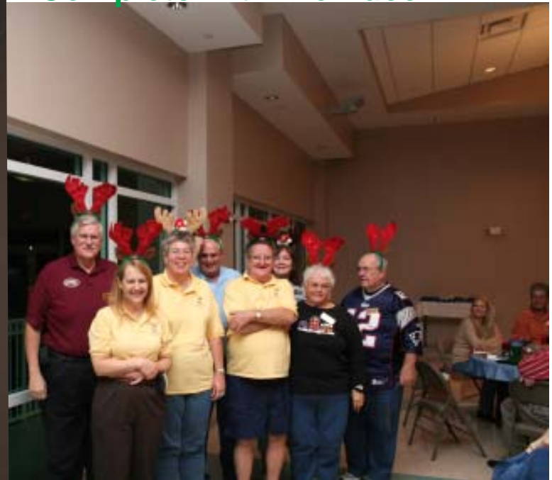
Tampa Bay 56ers Cake