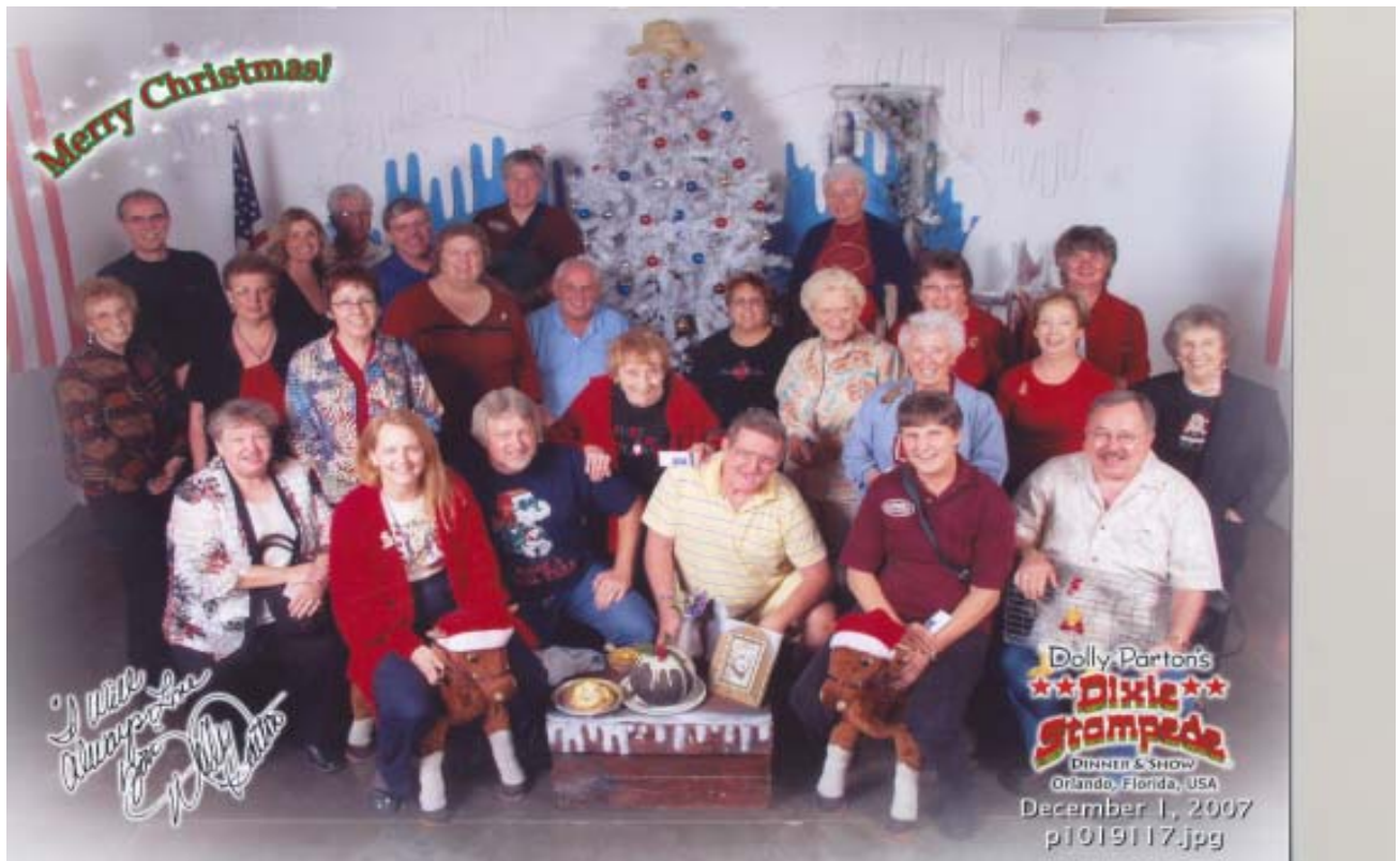
Tampa Bay 56ers attending the Christmas dinner show at Dixie Stampede and shopping at Hoopla Dept. 56 store in Orlando