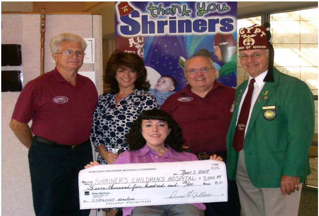
SSRG checks for $7,500 presented to the two charities