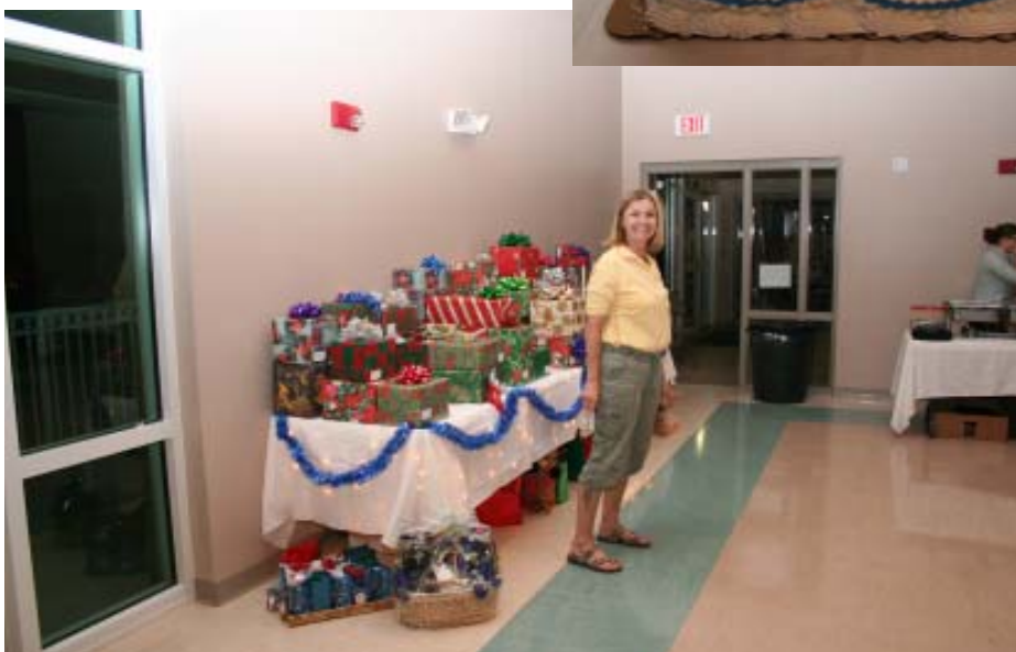
And Lots of Presents!