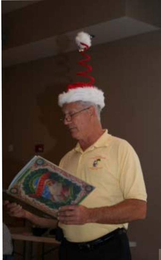
Reading the “T’was the Night Before Christmas”