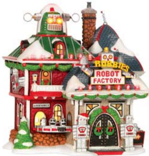
Robbie's Robot Factory North Pole Village