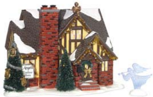
The Angel House Snow Village