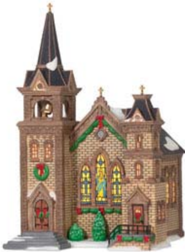
St. Mary's Church Christmas in the City Village

Department 56 has announced their spring introduction, which includes several pieces that are numbered and limited editions. Here are a few.