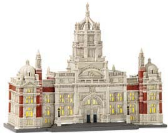
Victoria & Albert Museum Dickens Village